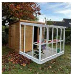
Gisburn Combi Greenhouse

We make beautiful, hand crafted, modern greenhouses. Our versatile range can be tailored to your individual requirements and is available to customers nationwide. We take great care in manufacturing our greenhouses which are installed by our expert installation technicians. In this way we are confident that your new Coppice Collection greenhouse will be installed to your complete satisfaction.