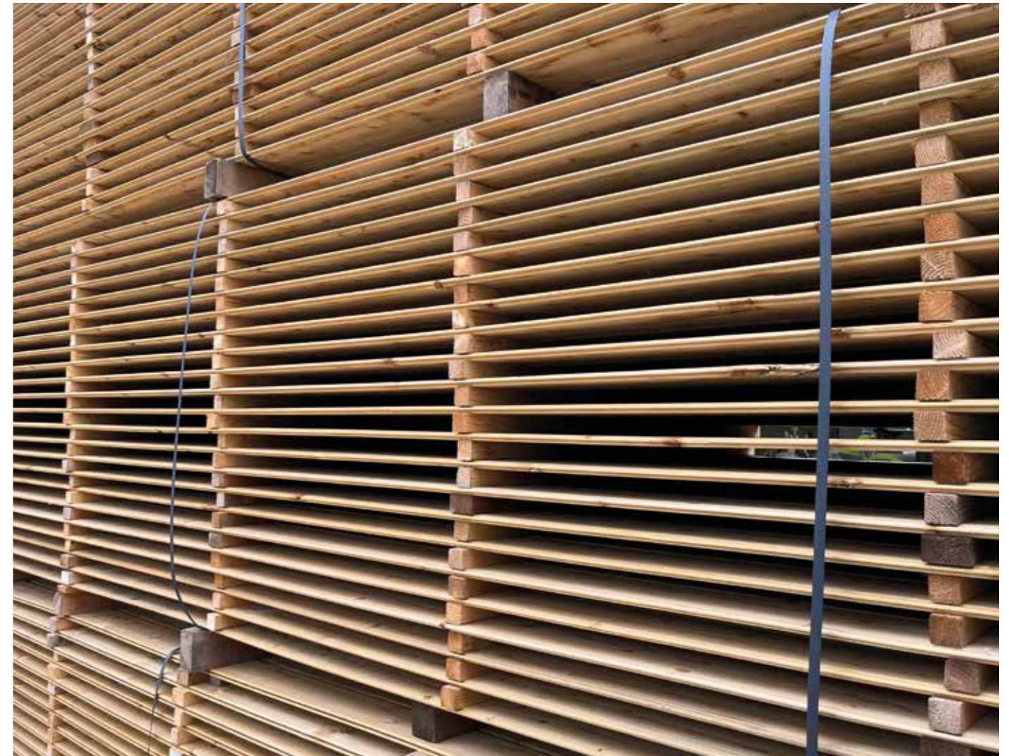
Latted timber drying process