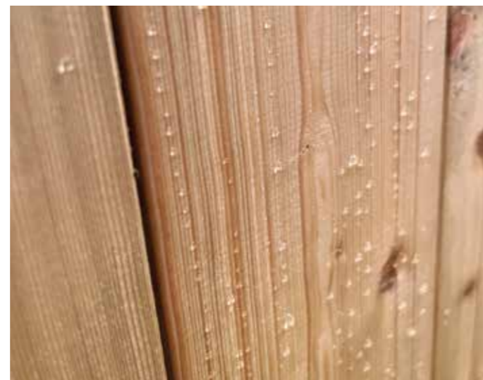
Water beading and run off after oil treatment

You have three basic options for care and maintenance of pressure treated wood: stains, sealants, and paints. You may also choose to oil the wood, which is fine and will give wood a glossy glow, but that doesn't mean you can skip the preservative stage. Any preservative, whether that's stain, sealant, or paint, will slow down the drying process and help keep your wood supple and straight.